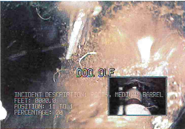
RMB - Roots, Medium: Barrel @ 0.0 ft.